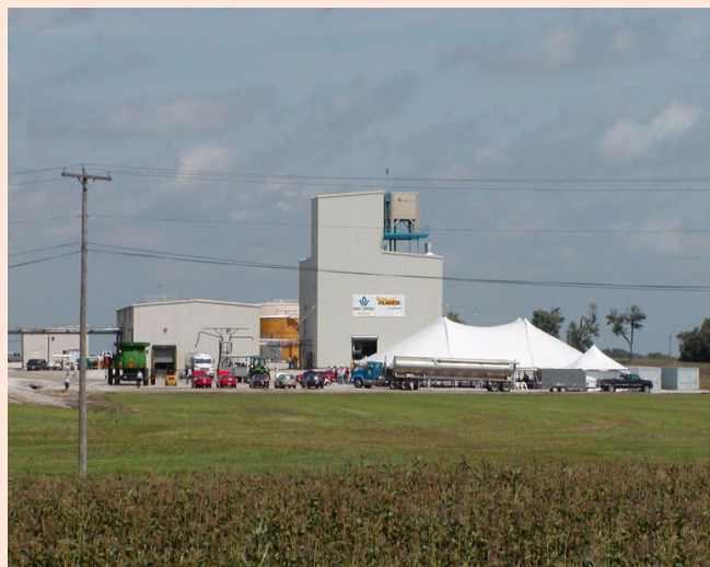
Figure 2. The West Central Biodiesel Facility in Ralston, Iowa, is expected to produce 6 million gallons of biodiesel annually.

Average consumption of gasoline and diesel in Organization for Economic Cooperation and Development (OECD) countries was 900 million tonnes from 1996-1999 (Agriculture and Agri-food Canada, 2002). The United States accounted for the largest share (51%) followed by the European Union (26%). However, considerable differences exist between countries in their use of gasoline and diesel. In the United States and Canada, gasoline accounted for 77% and 72% of the total fuel