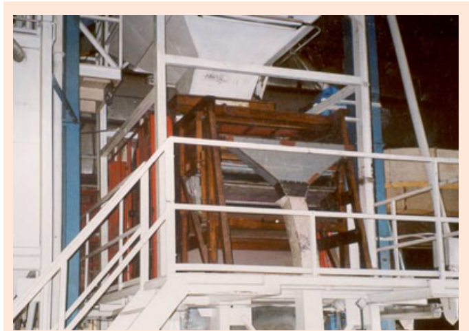
Figure 3. Pioneer-Argentina's only dedicated soybean asseta 30-year-old wooden soybean seed classifier.

conducted outside the country, limiting the multiplying effect of new knowledge. R&D expenses in the corn division are higher as well.