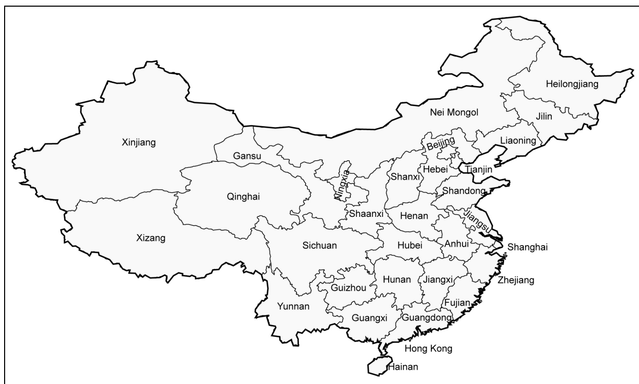
Figure 2. Map of China.

inces and cities (Denlinger, 2004). In 2004, the Chinese National Electric Watch Committee announced a 20 million kilowatts shortage in the country (Wang & Wang, 2004). The areas most affected in 2004 were primarily the eastern and southern provinces. Eastern China is short 10 to 15 million kilowatts, southern China 5 million kilowatts. In addition, northern and central China are short 3 million kilowatts (Wang & Wang, 2004).