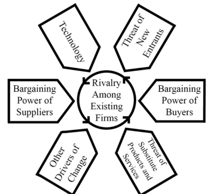
Figure 2: Value Chain for Plants, Animals, and their Products

Figure 2 provides a pictorial summary of the modified Five Forces framework. This framework was used by each of the authors of the articles for this theme to analyze the challenges, opportunities and changes for the various stages of the agribusiness value chain.