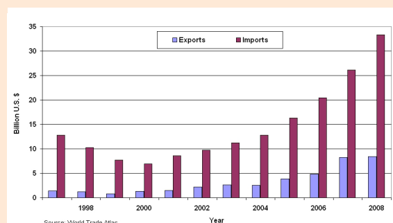
Figure 1. Russian Agricultural Trade

The move to a market economy in the 1990s reversed the expansion of the livestock sector during the earlier planned period. Because of budget stringency, the huge government support to agriculture, and especially the livestock sector which received the bulk of subsidies, was largely eliminated. Also, integration into world markets revealed that Russia was a high cost producer of livestock