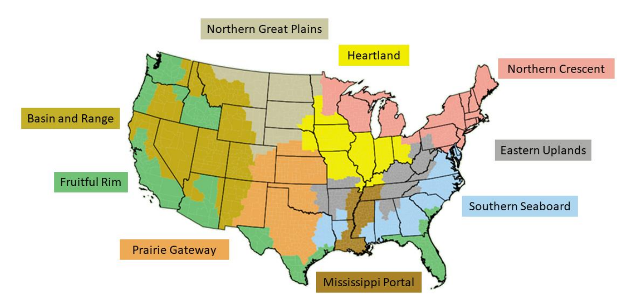
Figure A1. Farm Resource Regions